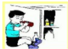
He is drinking some potion.