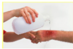
They have a burn.