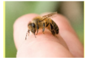
They have a bee sting.