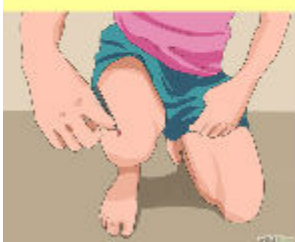
Take out the dirt. 🗣️