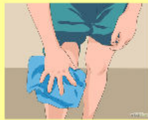
Dry your skin. 🗣️