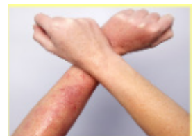
They have a rash.