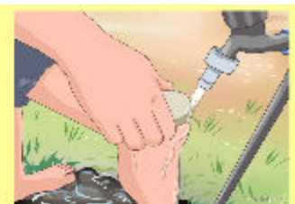
Clean with soap. 🗣️