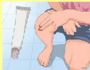
Put on the cream. 🗣️