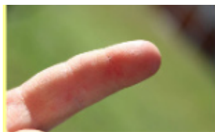
They have a splinter (wood). They have a sliver.