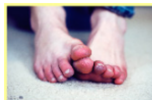
They have frostbite.