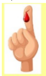
It is bleeding.