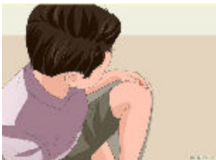
What do I do? 🗣️