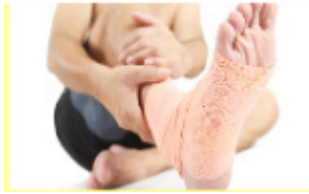
He has a sprained ankle.