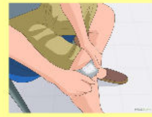
Put on a bandage. 🗣️