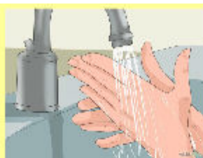
Wash your hands. 🗣️