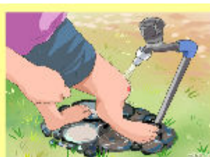
Rinse with water. 🗣️