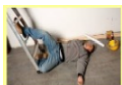
He fell down.