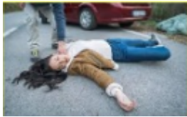
She is unconscious. She fainted.