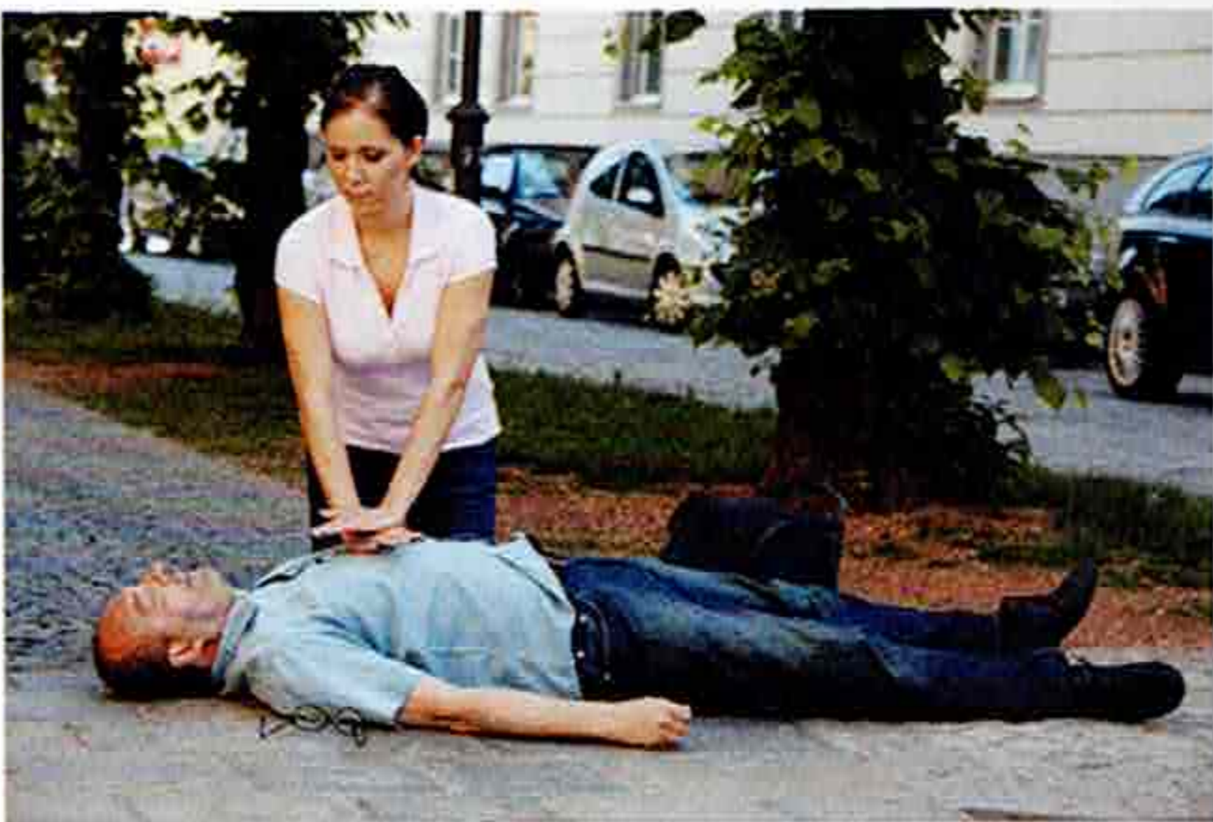
a) ___asic li___e su___ ___ort

Activity 4. Complete the words with the missing letters in your notebook.