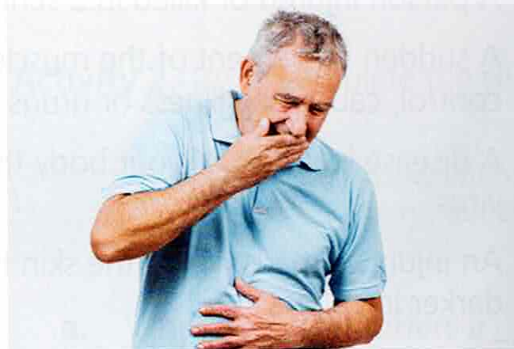
g) n___ ___s___a