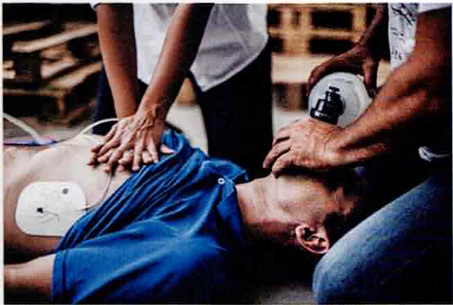
b) car___iores___irator___ arres___