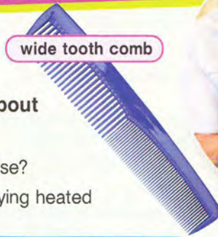
wide tooth comb