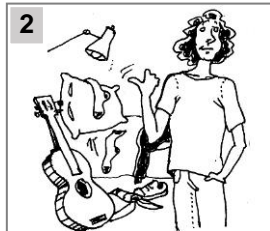
hopeful / messy