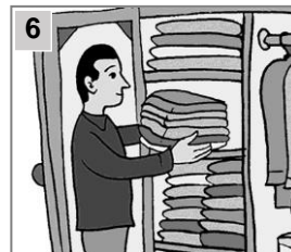
proud / neat