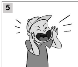
avoid / scream