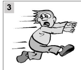
approach / run away