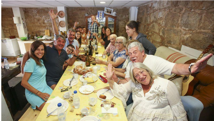
Stay with a local family ("homestay")

What's the best way to attract more tourists to Galicia?