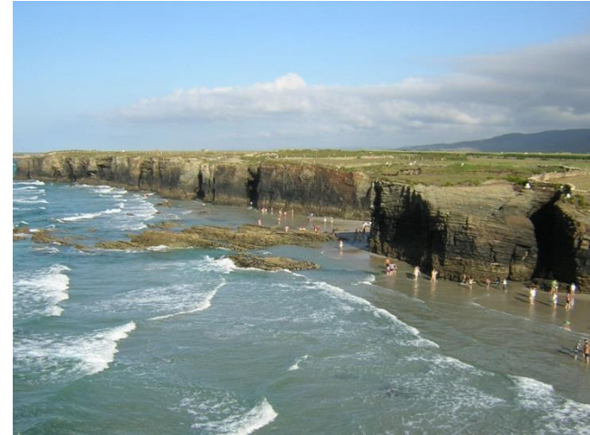
Beaches and nature