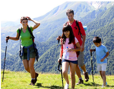
Hiking with your family