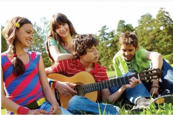
Hanging out with friends