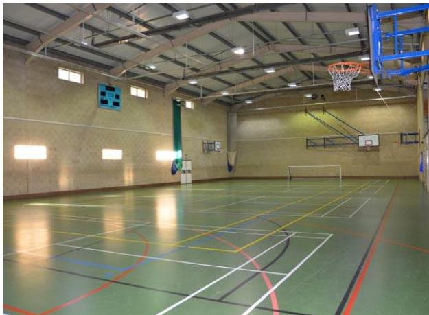
Indoor sports hall