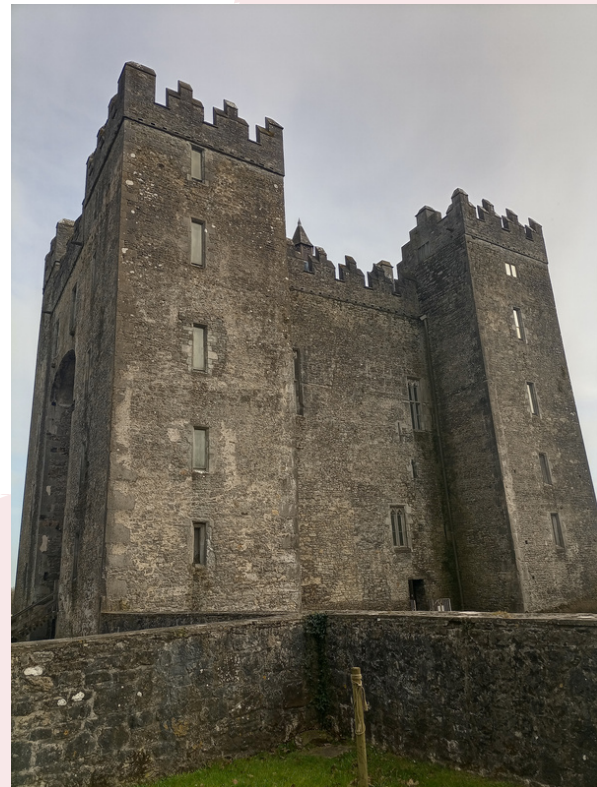
Bunratty Castle & Folkpark

We also enjoyed the delicious regional Irish cuisine