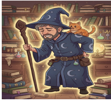
He has backache