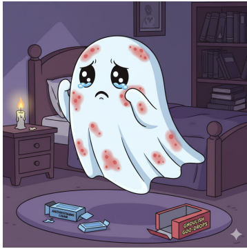
He has a rash