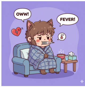
He has a temperature