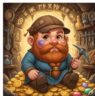
He has a bruise