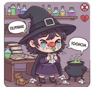
She has a runny nose