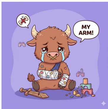
He has a broken arm