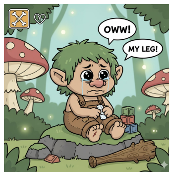
He has a cut