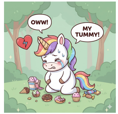
He has a stomach ache