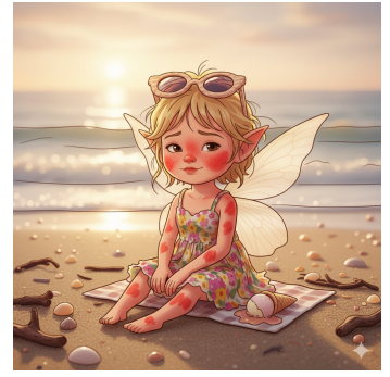
She has sunburn