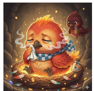
She has the flu