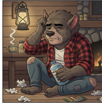
He has earache