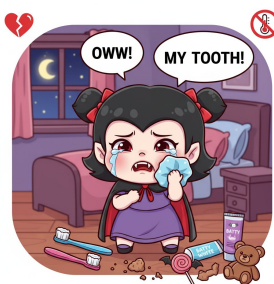
She has toothache