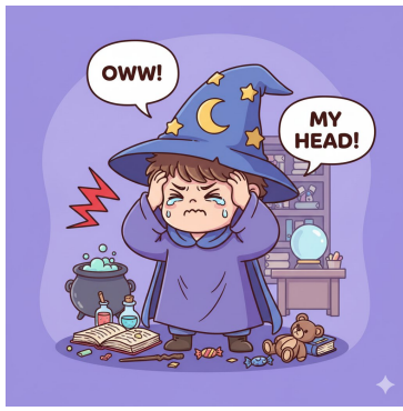
He has a headache