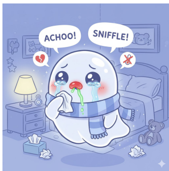
He has a cold