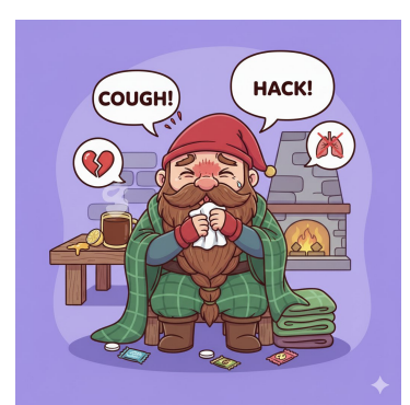
He has a cough